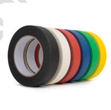
Crepe Paper Masking Tapes