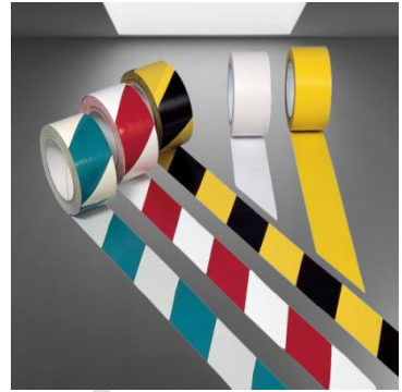
Floor Marking Tapes