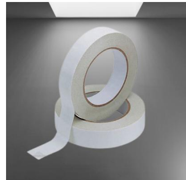
Double Sided Tissue Tapes