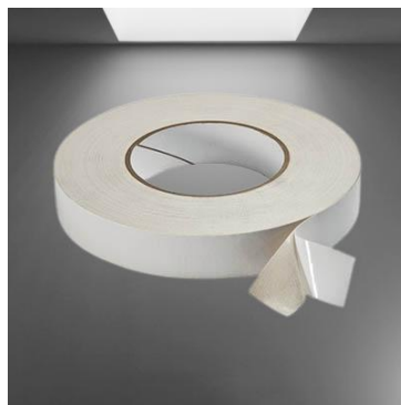
Double Sided Polyester Tapes