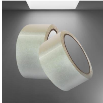
Bopp Transparent Tape