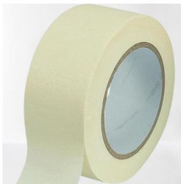
White Paper Tapes