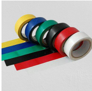
PVC Electrical tapes