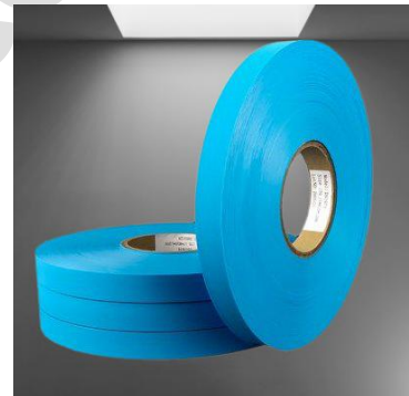
PPE Kit Sealing Tapes