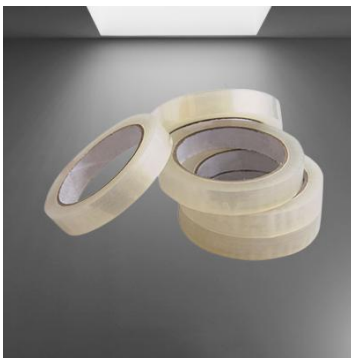
Self Adhesive Cello Tapes