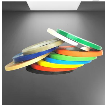
Bag Sealing tapes