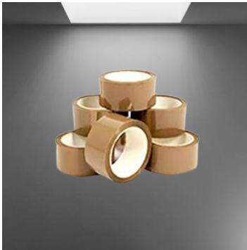
Bopp Brown Tape